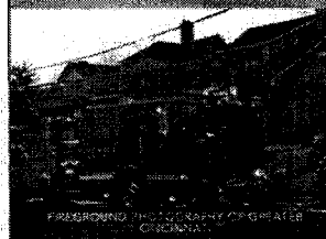
The Fire department and the Historical Society found Cheviot's 1929